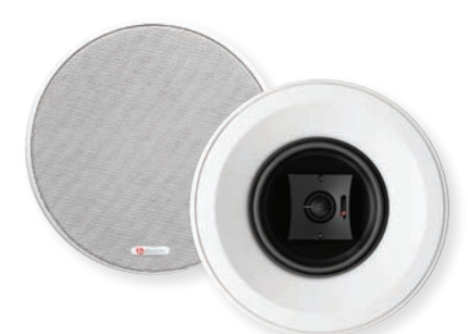
HSi 470 2-Way 6½" In-Ceiling Speaker